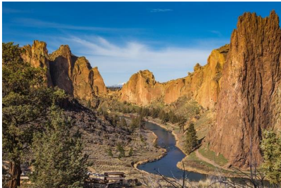
Smith Rock State Park