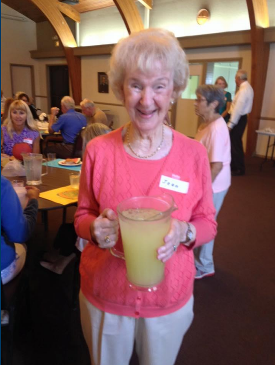
Good Shepherd Presbyterian, Los Alamitos