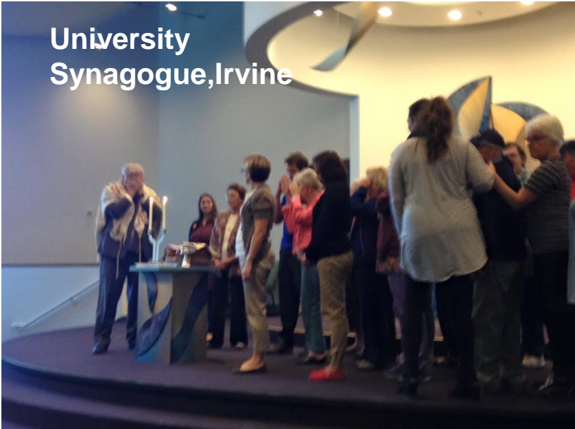
University Synagogue, Irvine