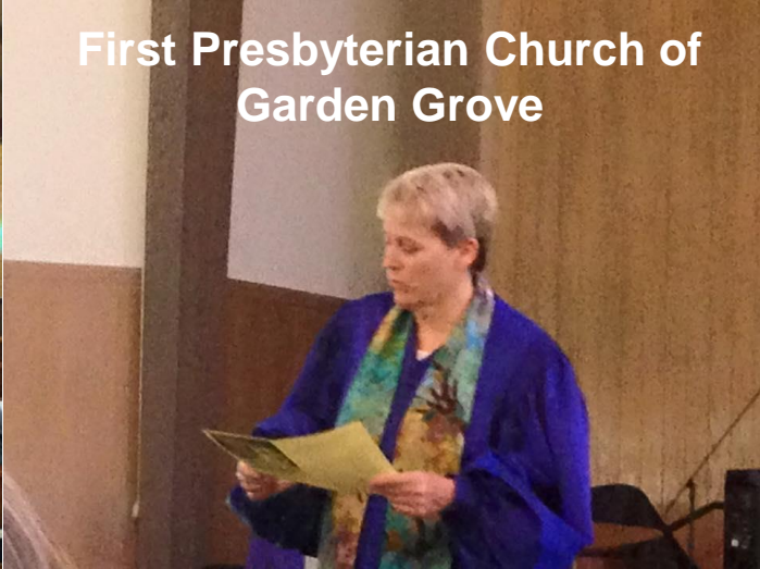
First Presbyterian Church of Garden Grove