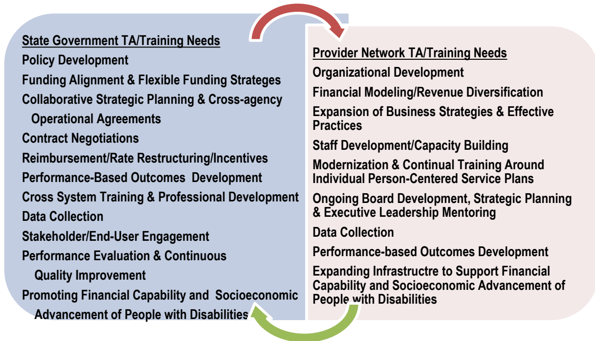
Figure 1. Technical Assistance (TA) & Support Strategic Areas for Assisting State Governments Undergoing Systems-Change and Provider Transformation Efforts

There are five common levers that facilitate state systems change endeavors. These include (as illustrated in Figure 2): demand change among target populations; development of evidence-based practices and evolution of models in service delivery; advances in the legal and policy landscape; maximizing efficiencies through goal alignment and resource coordination across systems; and demonstrated improvements in desired outcomes via rigorous performance measurement.