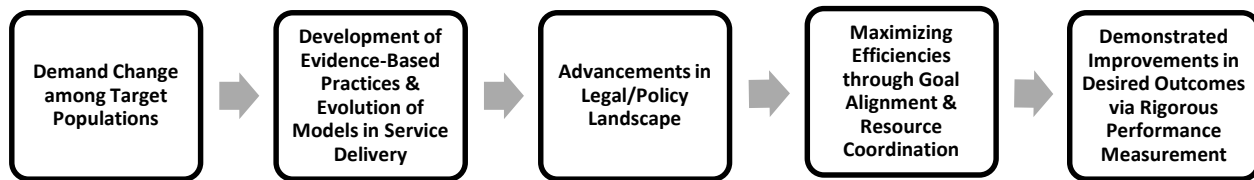
Figure 2. Facilitators of Cross-Systems Change Efforts

Additionally, the implementation of Employment First activities should be infused within a broader goal of ensuring that youth and adults with disabilities are meaningfully engaged in the community and have access to the individual supports required for full participation, optimal self-sufficiency, and socioeconomic advancement.