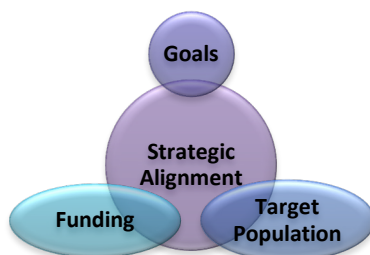
Figure 4. Aligning Goals, Target Populations, and Funding Options

As Figure 4 demonstrates, systems change efforts should consider an alignment of strategic goals, target populations, and funding streams.